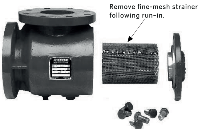
FIG. 3 Remove fine-mesh strainer

Inspect the cover O-ring and replace if necessary. Replace the cover into the body. Ensuring that the strainer is properly seated, tighten the cover bolts diagonally, evenly and firmly.